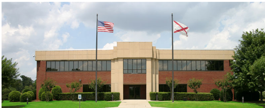
Alabama Supercomputer Center

Under Wayne's direction, a number of changes have been made to the physical facilities at the Alabama Supercomputer Center. Additional power capacity has been added by the replacement and expansion of UPS systems. Longer term disaster mode operations have been assured through the addition of a diesel generator and natural gas generator. The air conditioning systems have been replaced and expanded in order to accommodate more equipment on the computer room floor. These improvements have made it possible for the Alabama Supercomputer Center to provide more services than ever before. Tours of ASA's facilities are available upon request.