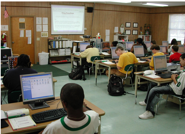
Students using up-to-date technology resources in computer lab.